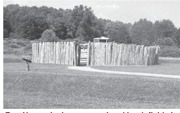
Fort Necessity is now a national battlefield site. It was built in 1754.

Pennsylvania, about 11 miles east of Chicago White Sox. The park comprises