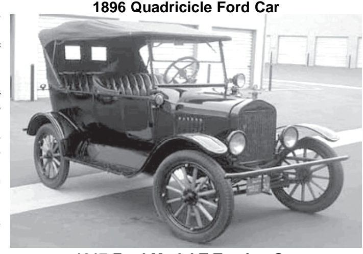
1917 Ford Model T Touring Car

in 1903. In October 1908, he offered the Model T for $950. In the Model T's nineteen years of Courier advertising a Woman's Rights production, its price dipped as low as $280. convention on the following Wednesday and Nearly 15,500,000 were sold in the United States alone. The Model T heralds the beginning of the Motor Age; the car evolved from luxury item for the well-to-do to essential James Mott, to chair the meeting, they began transportation for the ordinary man. Ford to draft a "Declaration of Rights and revolutionized manufacturing. Using a Sentiments". Through the eve of the constantly-moving assembly line and subdivision of labor, Ford realized huge gains in productivity.